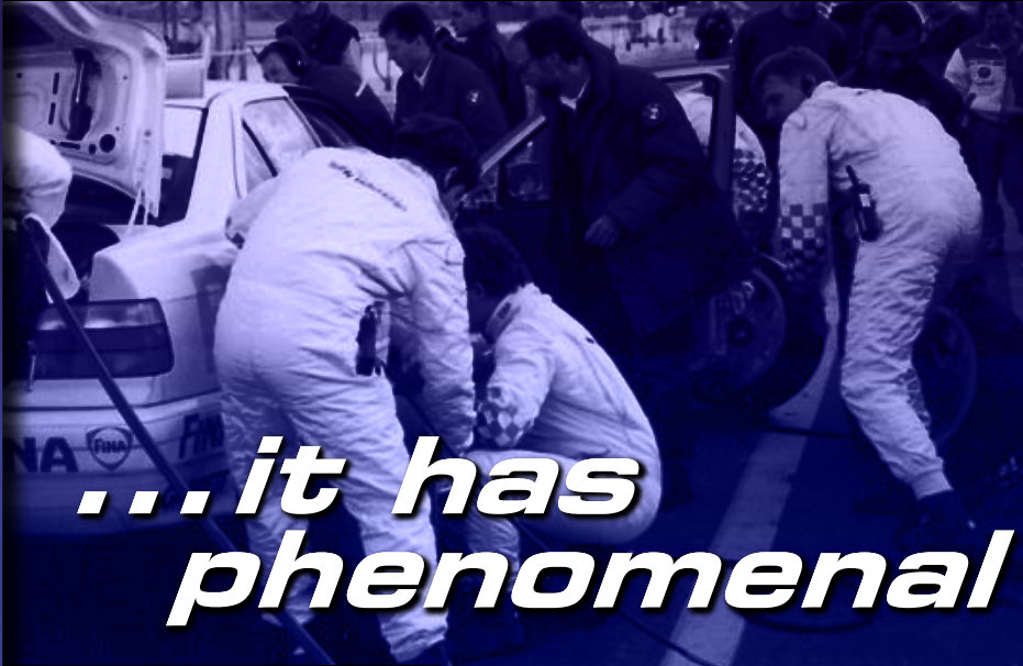
A Fast Team - Pit Stop during the 24-hour Race