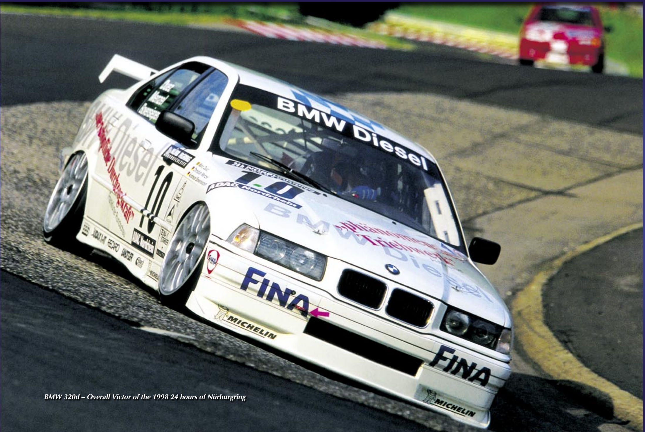
BMW 320d – Overall Victor of the 1998 24 hours of Nürburgring